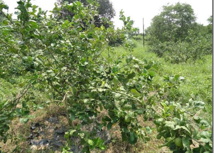
Fig.: Eureka Lemon Plant Mulches with black polythene

Transparent polythene mulch: Depending upon thickness and degree of capacity of polythene it absorbs little solar radiation and transmits about 80-90 % solar radiation. There is condensation of water drops under the polythene mulch. This water is